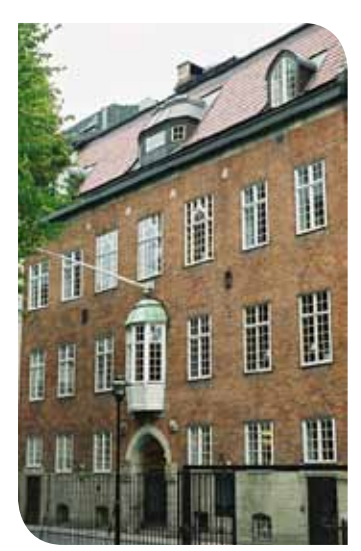
The Society's building at Klara Östra Kyrkogata 10 in Stockholm