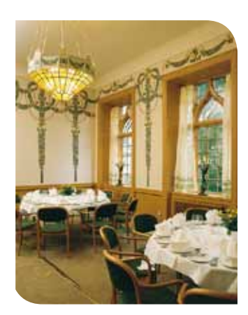
The on-site Restaurant