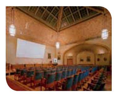
The conference Hall