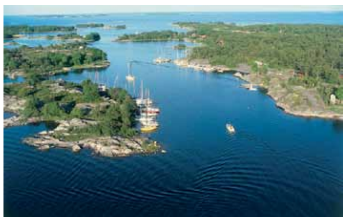
More about Sweden http://www.visitsweden.com/sweden/